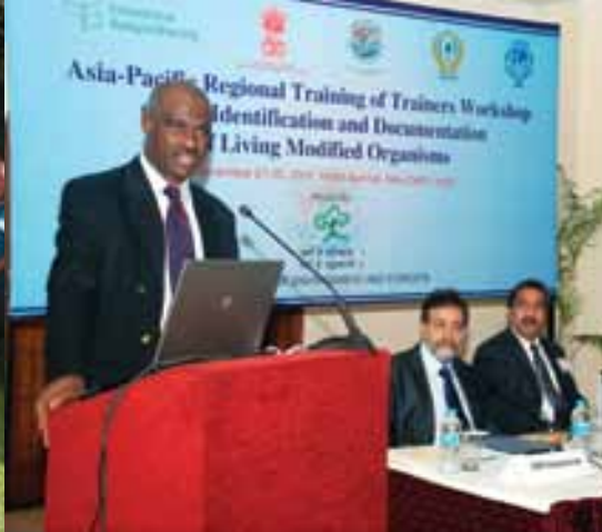
Asia Sub-regional Training of Trainers' Workshop on the Identification and Documentation of Living Modified Organisms, 21 - 25 November, New Delhi, India.