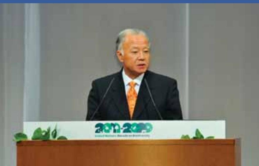
Kiyotaka Akasaka, Under-Secretary-General, United Nations Department of Public Information, delivered the message of Ban Ki-moon, Secretary-General of the United Nations. The Secretary-General called “on all the Parties to the Convention on Biological Diversity and to all the biodiversity-related conventions, as well as all members of the United Nations system, the private sector, civil society groups and individual citizens and consumers worldwide, to rally to the call of the United Nations Decade on Biodiversity.”