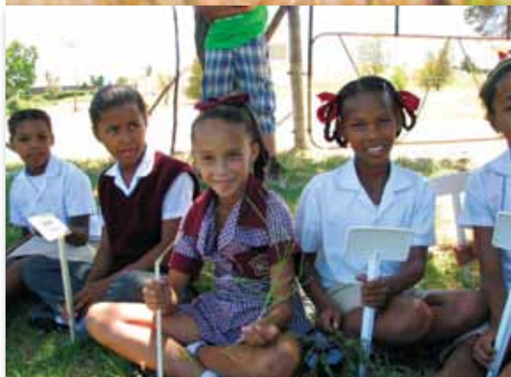
Students from Grades 5 and 6 planted indigenous trees in Wolseley, Western Cape, South Africa.

The Green Wave is a project to raise awareness and educate young people – tomorrow's leaders and citizens – on biodiversity and on actions to preserve life on Earth. The Green Wave encourages participants to engage in local action, build friendships with other participants around the world, work in local and international partnerships and learn about global issues affecting biodiversity. The Green Wave holds a celebration annually on 22 May – the International Day for Biological Diversity. In participating schools and groups, children and youth plant or take care of a tree at 10 a.m. local time, creating a "green wave" around the world. Participants upload photos and text to The Green Wave website to share their tree-planting stories with others. An interactive map goes live in the evening at 20:20 local time, creating a second, virtual, "green wave". For more information: greenwave.cbd.int