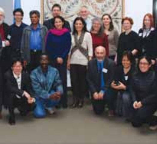
Participants to the sixth meeting of the Informal Advisory Committee on the Biosafety, held in Montreal, 30 March - 1 April.