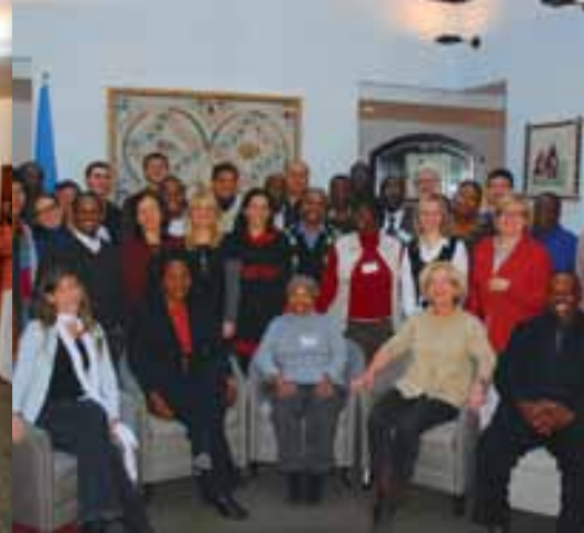
Participants to a biosafety workshop held at the CBD Secretariat in January.