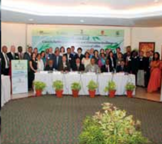
Workshop on Capacity-building for research and information exchange on socio-economic impacts of Living Modified Organisms under the Cartagena Protocol, 14 - 16 November, New Delhi, India.