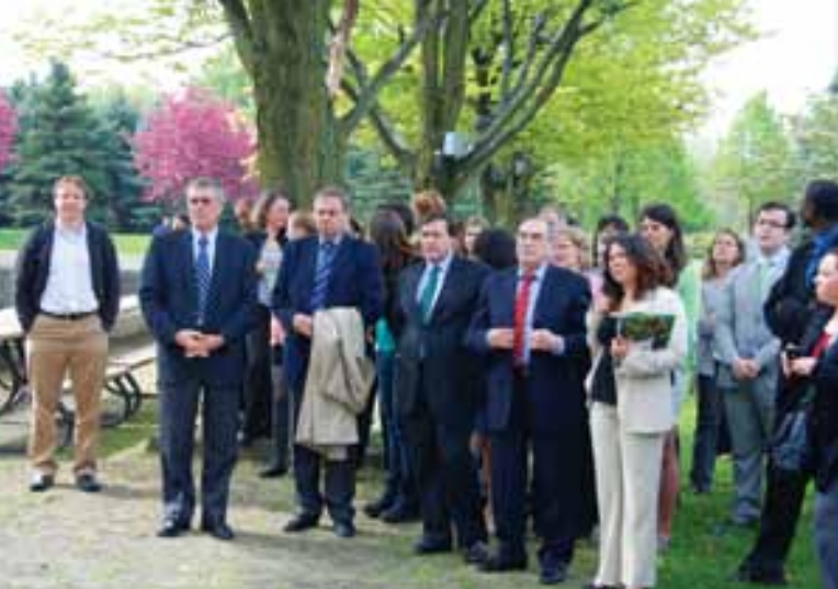
Representatives from the diplomatic corps and relevant organizations in Montreal attended the IDB celebrations, as well as the tree planting at the Biosphère, as a contribution to The Green Wave .