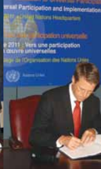
Samuel Žbogar, Minister for Foreign Affairs, Slovenia, signs on 27 September.