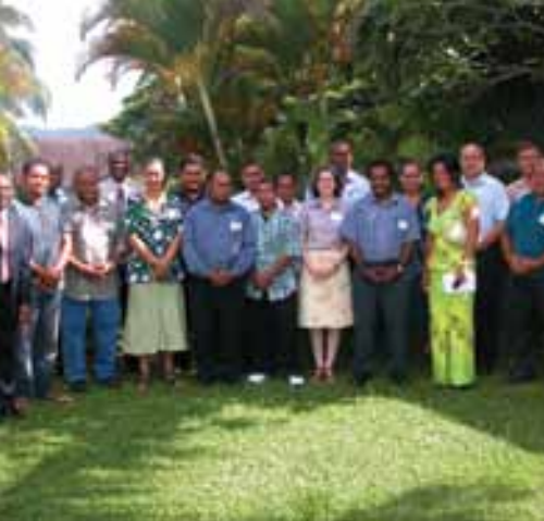
Pacific Sub-regional Workshop on Capacity-building for the Effective Implementation of the Biosafety Protocol, 28 - 30 November, Nadi, Fiji.