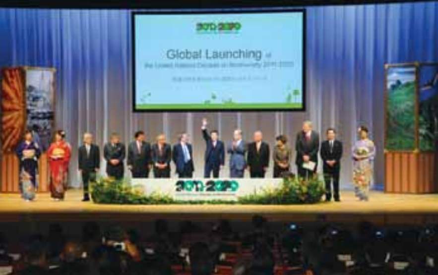
The global launch of the United Nations Decade on Biodiversity took place in Kanazawa, Ishikawa Prefecture, on 17 December.