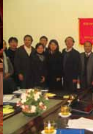
A workshop on the UN Decade was held in Hanoi in March.

important websites, tell others about their biodiversity activities and ask for or provide inspiring stories about their work with the natural world.