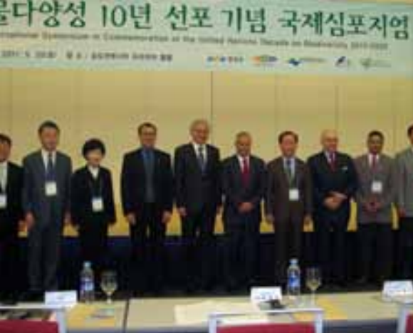
An International Symposium in Commemoration of the United Nations Decade on Biodiversity was held in the Republic of Korea in May.