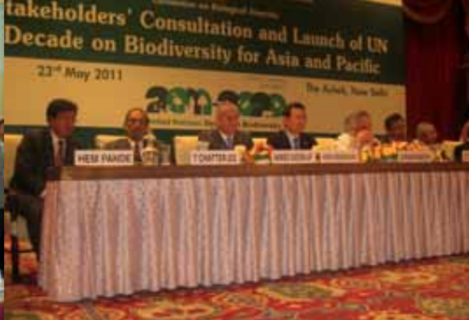
India hosted the launch of the UN Decade for the Asia and Pacific region in May, and held a national stakeholder consultative meeting that brought together representatives of civil society, the scientific community, UN agencies and other donors, as well as representatives of the business community.