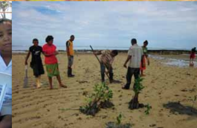
Participants from Tagaqa Village, Fiji, plant mangrove trees to protect their village

We invite you to join the movement and get ready for the 2012 Green Wave , which will celebrate the theme of the 2012 International Day for Biological Diversity: coastal and marine biodiversity.