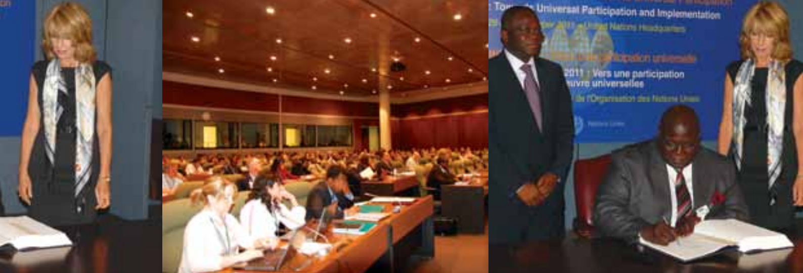
Participants discuss steps towards the implementation of the Nagoya Protocol at the Capacity-building Workshop on Access and Benefit-sharing, held in June in Montreal.