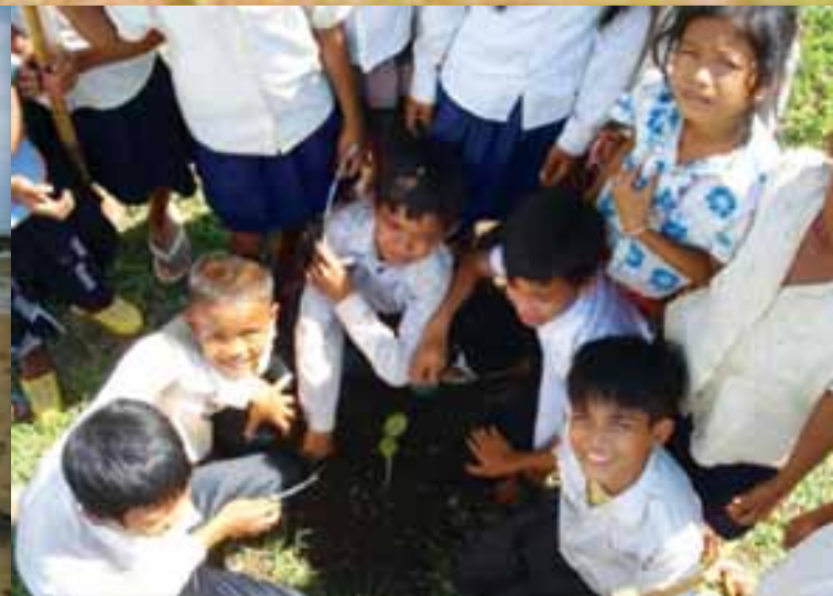
An environmental workshop and tree planting activity organized by the Children Forest Program was held in Chum Kiri Primary School in Tbong Khmon District, Kampong Chan, Cambodia.