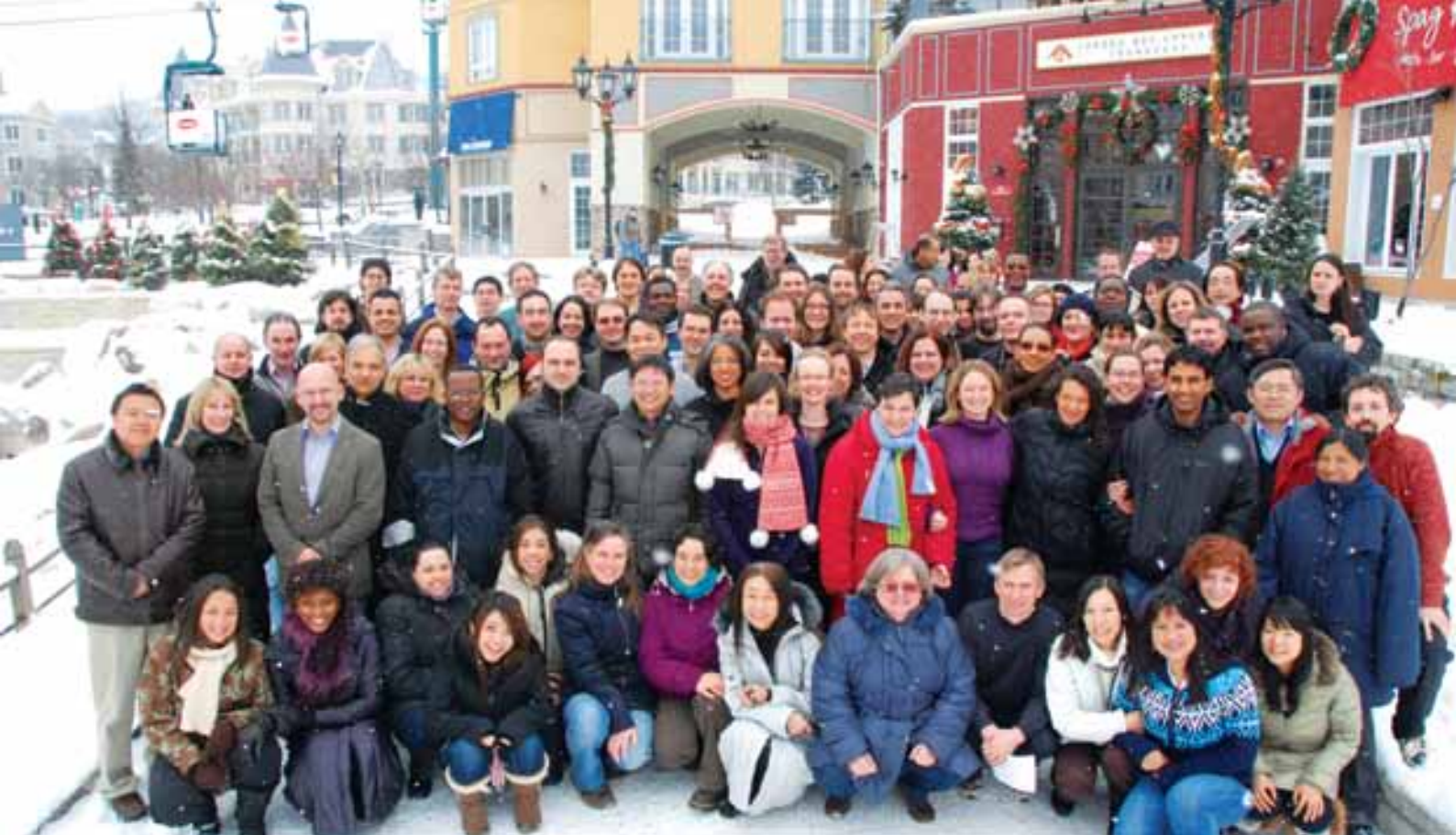
CBD Secretariat at the staff retreat in Mont Tremblant, Quebec, in February.

administered by GEF to support implementation of the Nagoya Protocol and to which the Government of Japan has contributed an initial grant of $10 million.