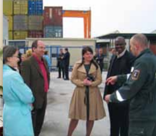
Field visit during the training of trainers workshop on the identification and documentation of LMOs for Central and Eastern Europe, held in Slovenia in April.

discussed a project proposal to strengthen national and regional capacities to implement the Protocol.