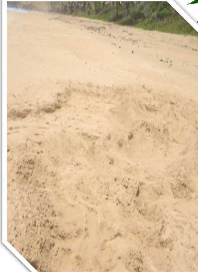
Turtle nest: Photographer – Alicia Valasse